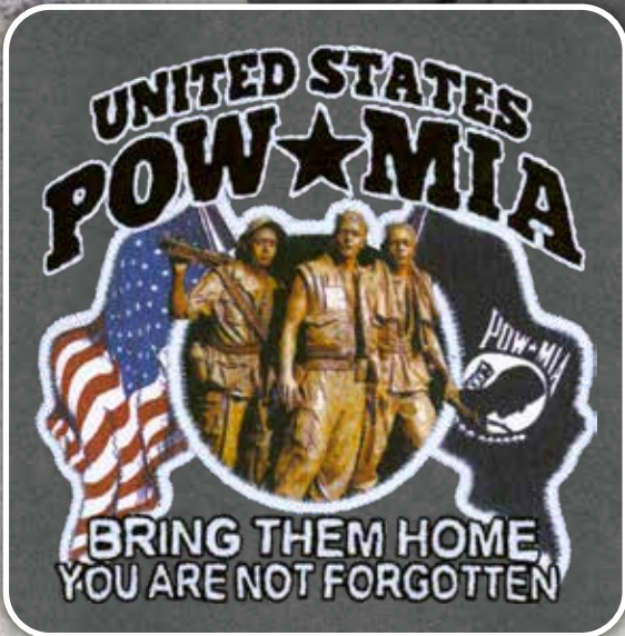
Close-Up of Embroidered Appliqué Design