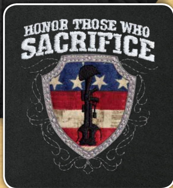
Close-Up of Embroidered Appliqué Design

ALL ORDERS MUST BE SUBMITTED AND PAID BY: